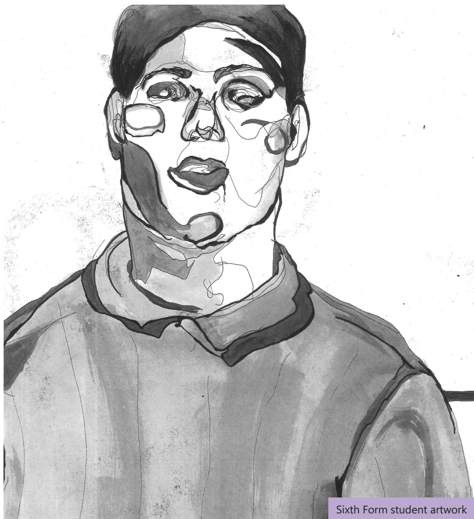
Sixth Form student artwork