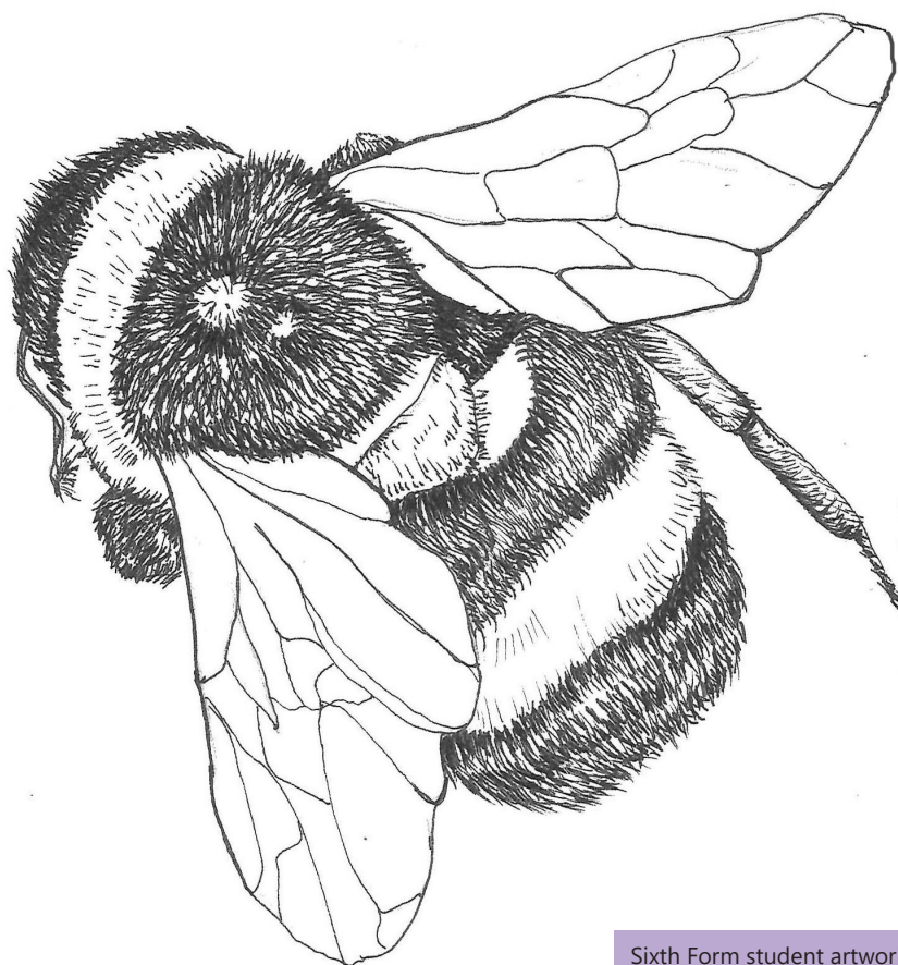
Sixth Form student artwork

ParentPay's unique web application allows parents/guardians to make secure online payments for all school charges, for example, school lunches, trips, extra-curricular lessons and enrichments, thus eliminating the need for students to carry money whilst at school. You will receive a ParentPay activation letter at the beginning of the Autumn term.