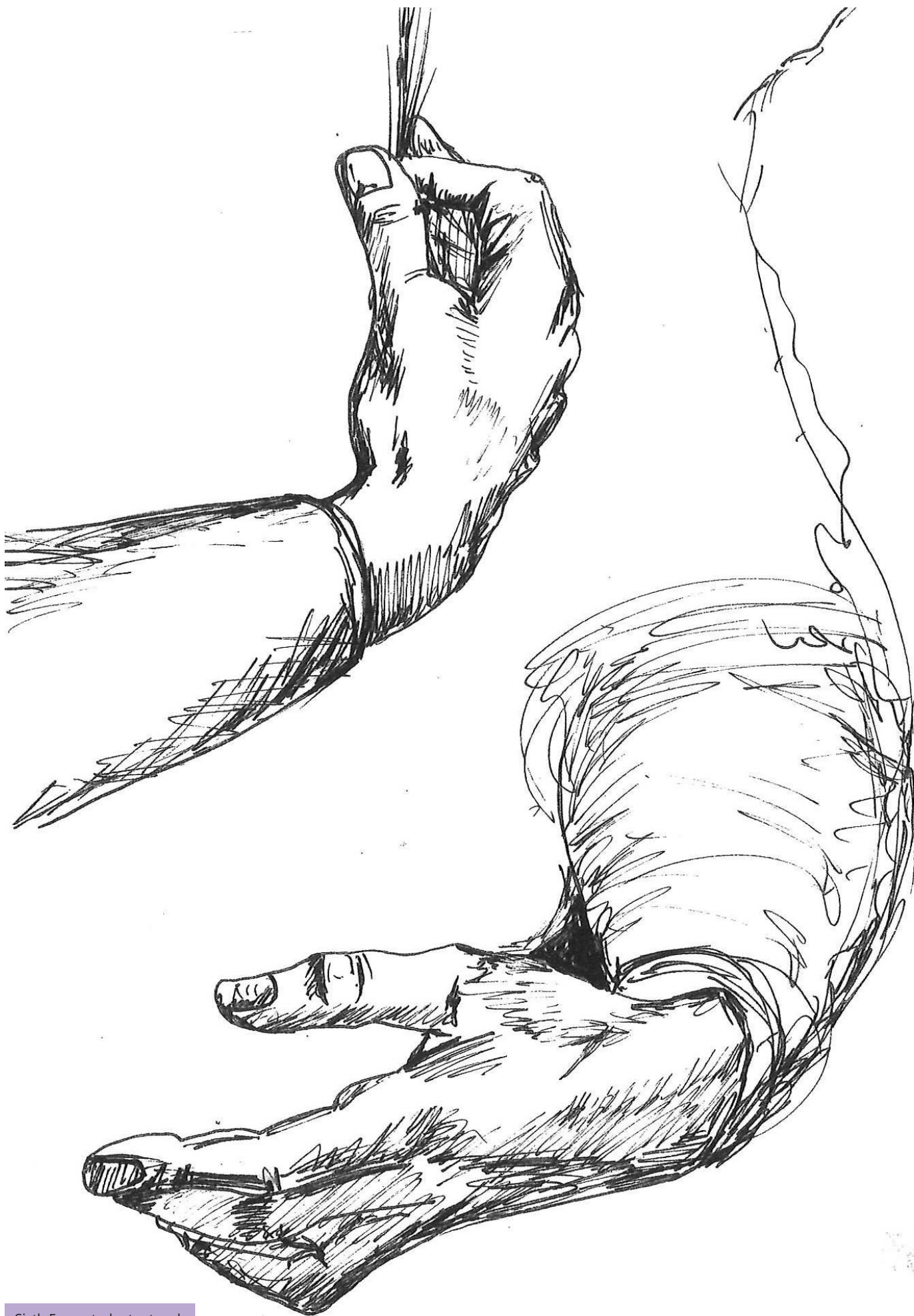
Sixth Form student artwork